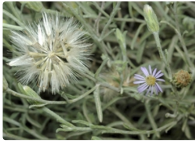
Flower, seeds, and leaves. near Bredbo