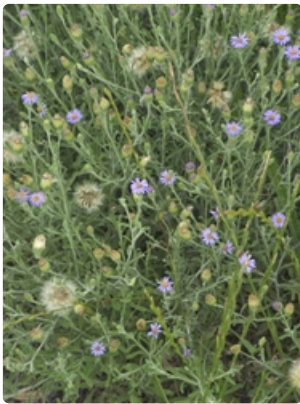
Flowering plants. Photographer Russell Best, near Melbourne