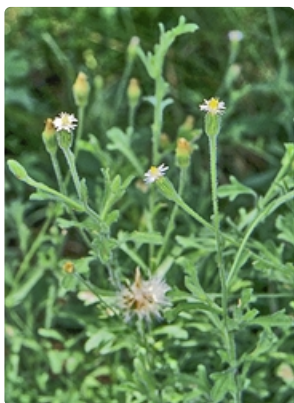
Flowers, leaves, and seeds. Photographer Don Wood, Carnarvon Station Bush Heritage Reserve via Augathella, Qld