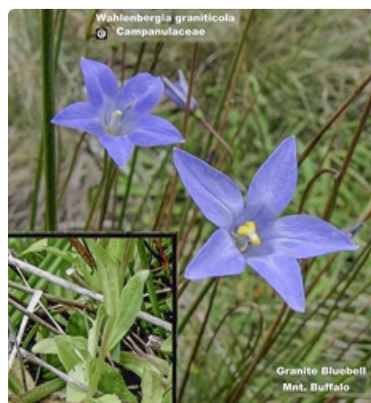
Flowers and leaves. Mt Buffalo, Vic