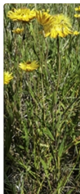
Flowering plants. Gisbourne Swamp, Vic