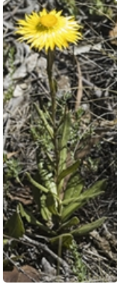
Flowering plant. Australian Plant Image Index, photographer Murray Fagg, Kosciuszko National Park