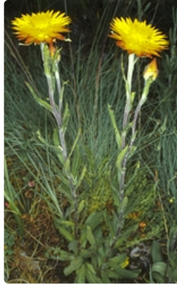
Flowering plant. Namadji National Park, ACT