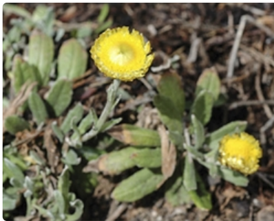
Flowering plants.