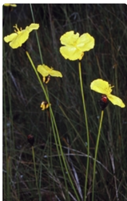
Flowering stems. Photographer Don Wood, Morton National Park