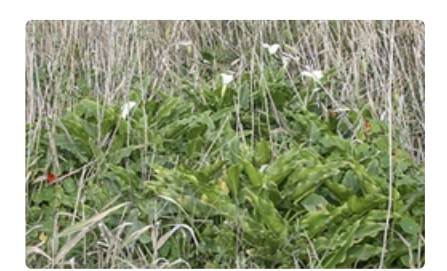
Rants. Australian Rant Image Index, Apollo Bay, Vic