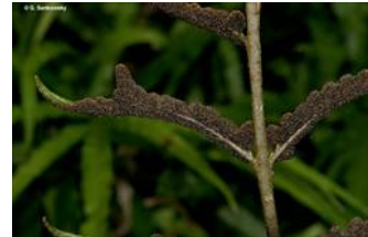
Close up of frond showing sori.