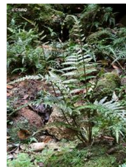
Habit. © CSIRO