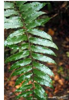
Close up of frond showing upper (adaxial) side.