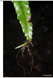
Bulbil.