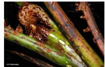
Crozier and stipe scales. © G.