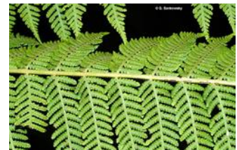
Close up of frond showing upper