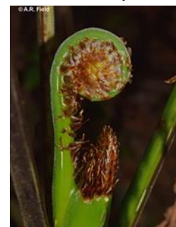
Crozier. © A.R. Field