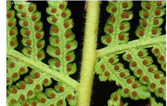
Close up of frond showing sori.

Field AR, Quinn CJ, Zich FA (2022) ' Platynerium superbum ', in Australian Tropical Ferns and Lycophytes. apps.lucidcentral.org/fern/text/entities/platynerium_superbum.htm (accessed online INSERT DATE).