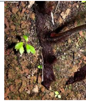
Rhizome.