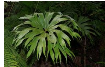
Frond.