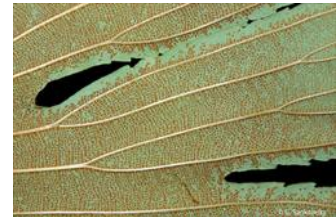
Close up of frond showing sori.