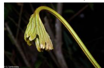
Young frond; stipe hairs.