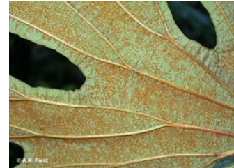
Close up of frond showing sori.