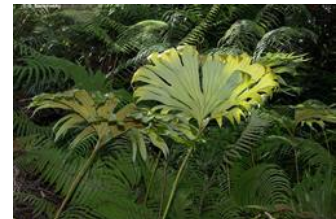
Frond.