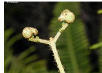
Crozier.