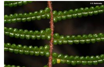
Close up of frond showing upper