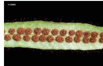
Close up of frond showing sori.