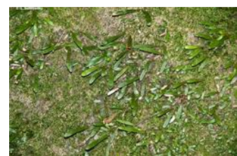
Habit. © G. Sankowsky