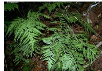
Habit. © G. Sankowsky

Copyright © Australian Tropical Herbarium 2022, all rights reserved.