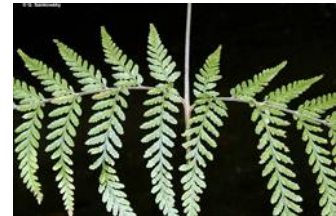
Close up of frond showing upper (adaxial) side.