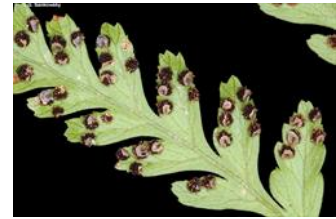
Close up of frond showing sori.

Field AR, Quinn CJ, Zich FA (2022) ' Platyserium superbum ', in Australian Tropical Ferns and Lycophytes. apps.lucidcentral.org/fern/text/entities/platyserium_superbum.htm (accessed online INSERT DATE).