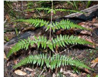
Frond.