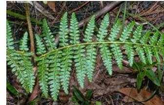
Frond, upper (adaxial) side.