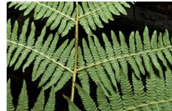
Frond, stipe hairs.

Field AR, Quinn CJ, Zich FA (2022) ' Platycerium superbum ', in Australian Tropical Ferns and Lycophytes. apps.lucidcentral.org/fern/text/entities/platycerium_superbum.htm (accessed online INSERT DATE).