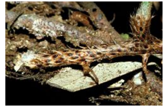
Rhizome.