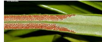
Close up of frond showing sori.