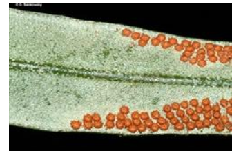
Close up of frond showing sori.