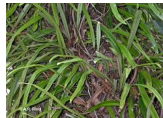
Habit. © A.R. Field