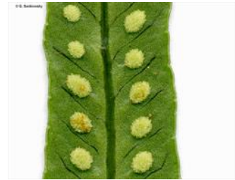
Close up of frond showing sori.

Field AR, Quinn CJ, Zich FA (2022) ' Platyserium superbum ', in Australian Tropical Ferns and Lycophytes. apps.lucidcentral.org/fern/text/entities/platyserium_superbum.htm (accessed online INSERT DATE).