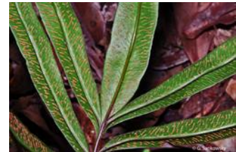
Close up of frond showing sori.