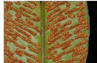
Close up of frond showing sori.

Field AR, Quinn CJ, Zich FA (2022) ' Platyserium superbum ', in Australian Tropical Ferns and Lycophytes. apps.lucidcentral.org/fern/text/entities/platyserium_superbum.htm (accessed online INSERT DATE).