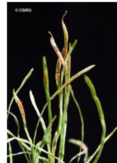
Close up of frond showing sori.