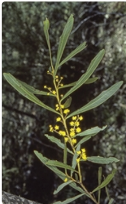
Flowering stems. Photographer Don Wood, Bungonia Gorge