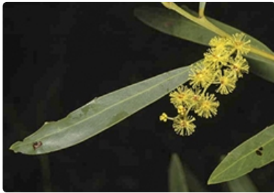
Flowering stems. Mt Annan Botanic Gardens near Campbelltown, NSW