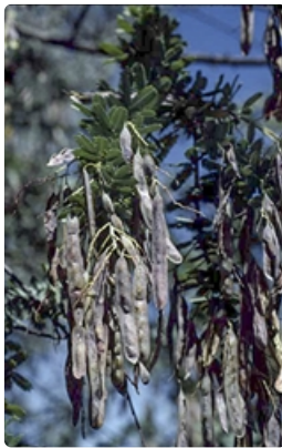
Pods and leaves.