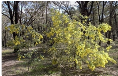
Shrub. Australian Plant Image Index, photographer Murray Fagg, near Cootamundra