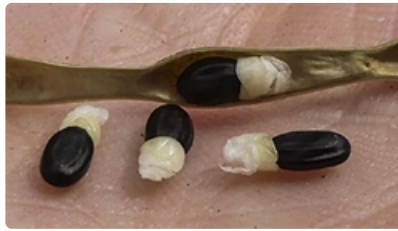
Seeds with white arils.