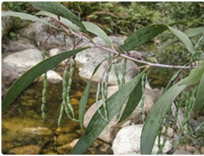
Branch with pods.