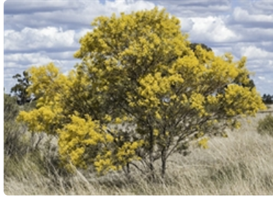
Shrubs. near Weethalle