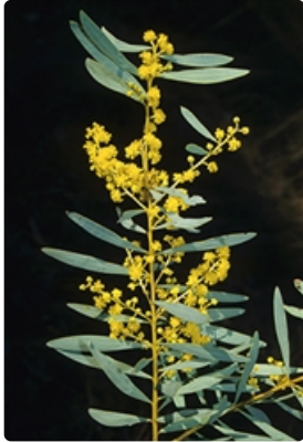
Flowering stem. Photographer Don Wood, Carnarvon Station Bush Heritage Reserve, via Augathella, Qld