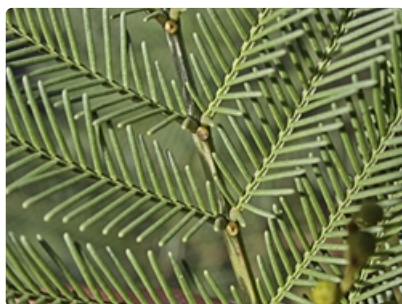
Leaf detail.