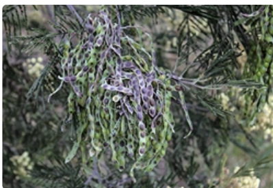
Pods and leaves. Australian Plant Image Index, photographer Arthur Chapman, east of Ballan, Vic