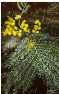
Flowering stem. Oatlen Road east of Tarago