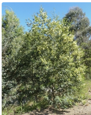
Shrub. Photographer Donald Hobern, Canberra, ACT