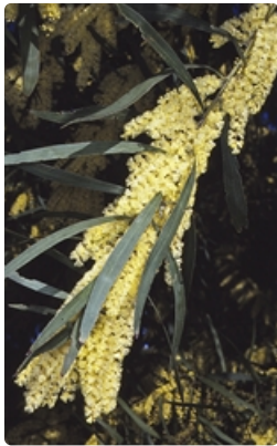
Flowering stem.