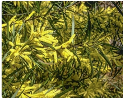
Flowering stems.