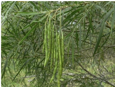
Pods and leafy stems.