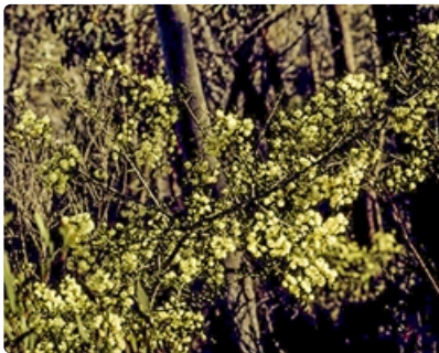
Shrub. Black Mountain, Canberra, ACT