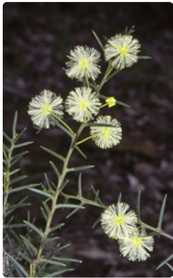
Flowering stems. Nadgee State Forest, south of Eden