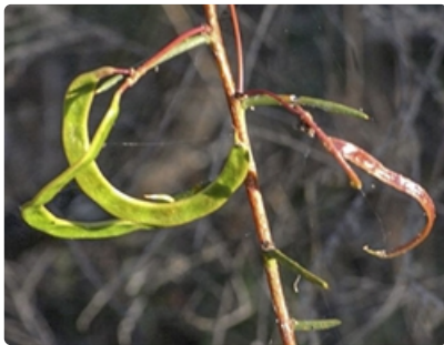
Pods. Sedgwick State Forest near Bendigo, Vic