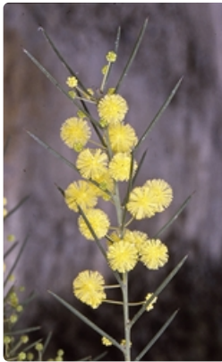
Flowering stem. Bungonia State Recreation Area