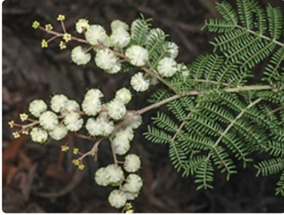
Flowering stems and leaves. Australian Plant Image Index, photographer Murray Fagg, Australian National Botanic Gardens, Canberra