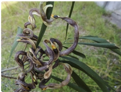
Open pods.