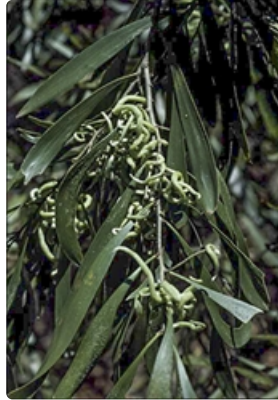
Young pods and 'leaves'.