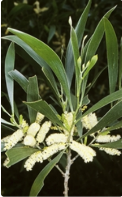
Flowering stem. Buckenbowra State Forest north west of Batemans Bay