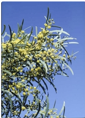
Flowering stems. near Manangatang, Vic