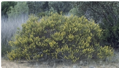
Shrub. Australian Plant Image Index, photographer Murray Fagg, Wyperfeld National Park, Vic