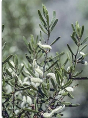
Stems with pods.