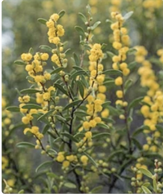
Flowering stems. Wyperfeld National Park, Vic