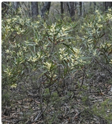
Shrub. Tallaganda National Park east of the ACT