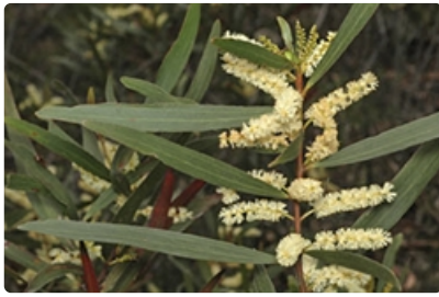
Flowering stem Australian Plant Image Index, photographer Murray Fagg, Tallaganda National Park east of the ACT