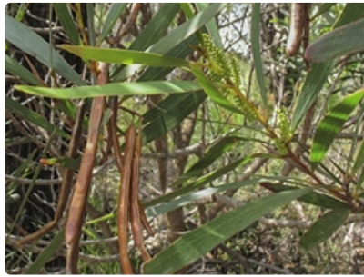
Leafy stems with flower buds and pods.