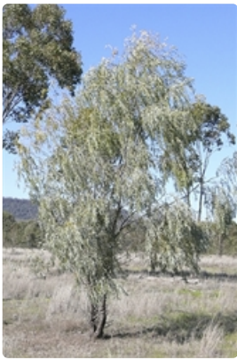
Young tree. Carnarvon Station Bush Heritage Reserve, via Augathella, Qld