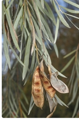
Old pods and leaves.