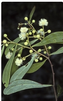
Flowering stems and 'leaves'. Wadbilliga National Park