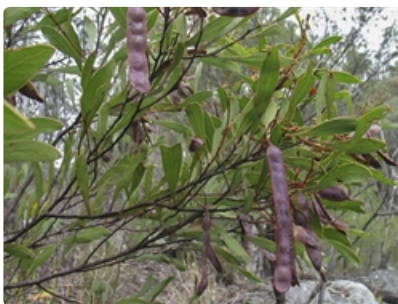
Leafy stems with pods.