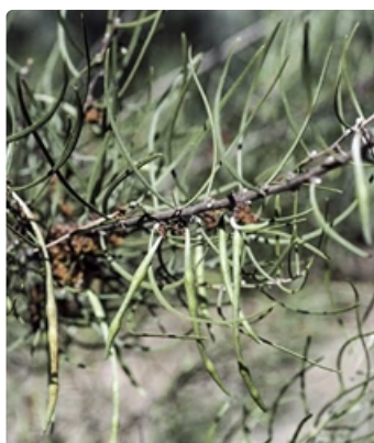
Stems with pods.