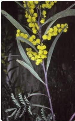
Flowering stems and 'leaves'. Endrick River north east of Nerriga