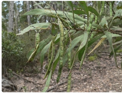
Leafy stem with pods.