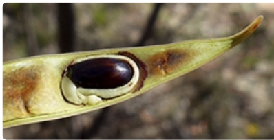
Open part pod with seed.