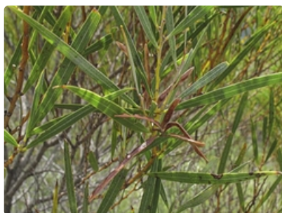
Leafy stems with young pods.