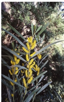
Flowering stems and 'leaves'.