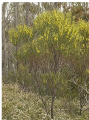
Shrub, photographer Jackie Mles, near Mogo south of Batemans Bay