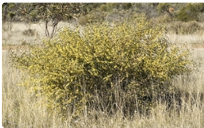
Shrub. Alleena to Tallirba, NSW