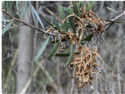
Leafy stems with open pods. Photographer Lorraine Phelan, Lake Hindmarsh, Vic