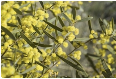
Flowering branches. Alleena to Tallirba, NSW