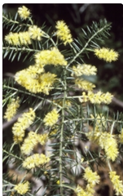
Flowering stems. Nadgee State Forest south of Eden