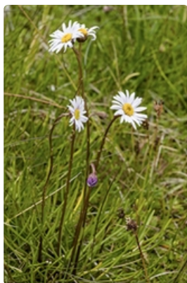
Flowering plant. Lake Mountain, Vic