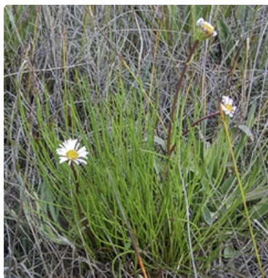
Flowering plants. near Gisborne, Vic