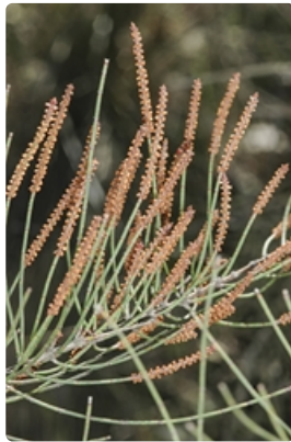
Male flowers on stems. Photographer Chris Lindorff, Willum Nature Reserve east of Melbourne, Vic