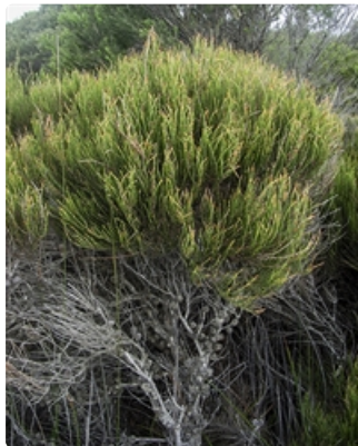
Shrub. near Mallacoota, Vic