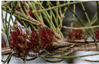
Female flowers on stems. Photographer Russell Best, near Princetown, Vic