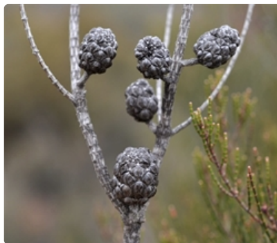
Cones. Little Desert National Park, Vic