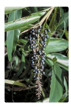
Fruit. Australian Plant Image Index, Australian Tropical Rainforest key