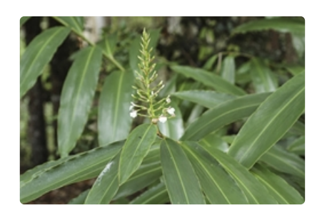
Flowers and leaves. Maroochy Regional Botanic Garden, Qld