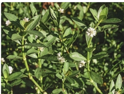
Plants. Indonesia