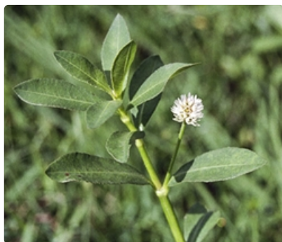
Flowering stem. Indonesia