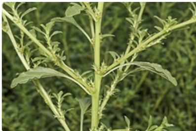
Flowering stems. between Boorowa and Crookwell