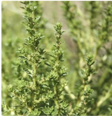
Flowering stems.