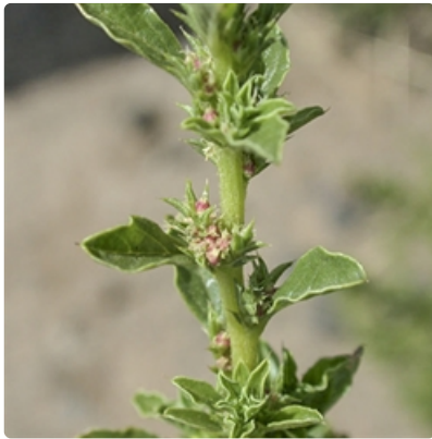
Flowering stem. Australian Plant Image Index, photographers RG & FJ Richardson, Little River, Vic