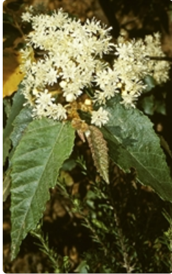
Flowers and leaves. near Bega