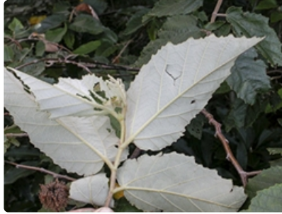
Backs of leaves.