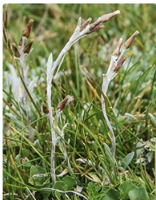
Flowering plants. Photographer Natalie Tapson, Tas