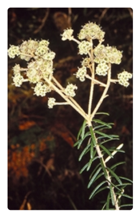
Flowering stem. southern edge of Bournda National Park near Tura Beach