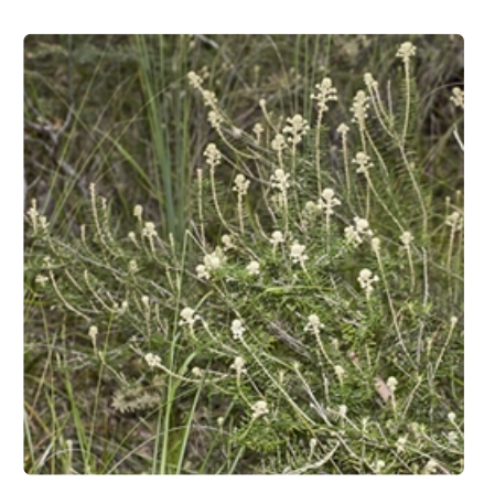
Flow ering shrub. Bournda National Park south of Tathra