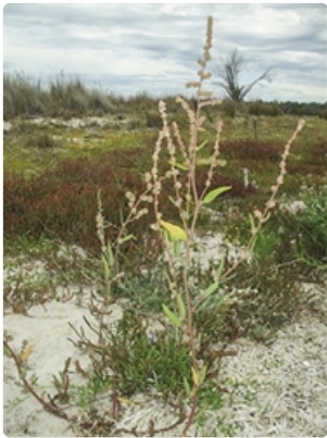
Flowering and seeding plant. Photographer Jackie Miles, Bournda Education Centre south of Tathra