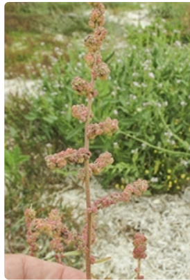
Flowering stem. Photographer Jackie Miles, Bournda Education Centre south of Tathra