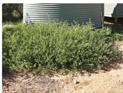
Shrub. Scotia Sanctuary, western NSW