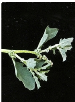
Stem with seed cases. Photographer Don Wood, Scotia Sanctuary, western NSW