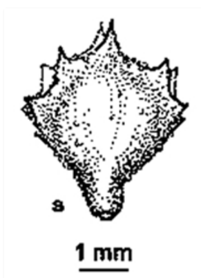
Line drawing. s. dry fruit. M.Mbir, National Herbarium of Victoria, © 2021 Royal Botanic Gardens Board