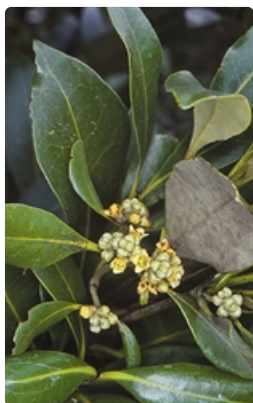
Flowers and leaves. Batehaven south of Batemans Bay