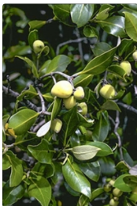
Seed cases and leaves. Australian Plant Image Index, photographer Murray Fagg, near Adelaide