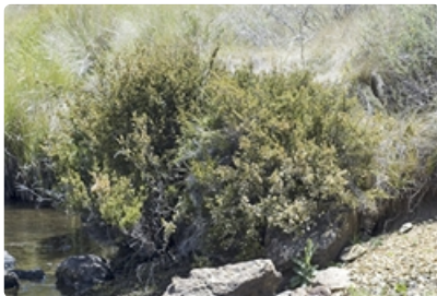
Shrub. Australian Plant Image Index, photographer Murray Fagg, Kosciuszko National Park