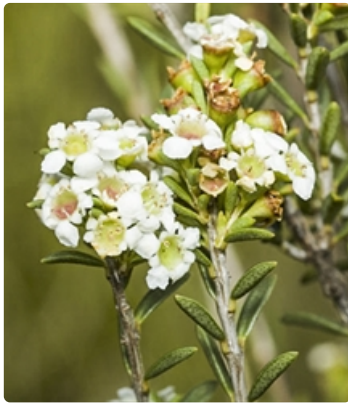
Flowers and leaves. Australian Plant Image Index, photographer Murray Fagg, Kosciuszko National Park