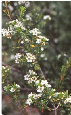
Flowering stem.