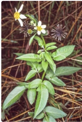
(var. minor ) Flowering and seeding plant. Photographer Don Wood, Narooma