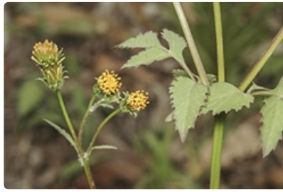
(var. pilosa ) Flower heads and leaves. west of Bega